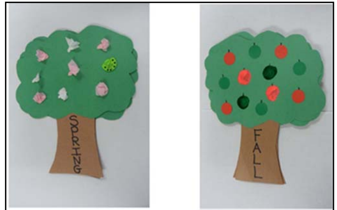
Apple Blossom Tree

Wear the life cycle of an apple as necklace! This activity uses plastic jewelry size baggies, pony beads, confetti and yarn to show the different steps in the life of an apple.