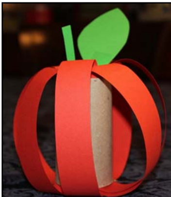
Toilet Paper Roll Apple

Create your own 3-D apple using strips of construction paper and brass paper fasteners (brads). Beef it up by having students write apple facts on their strips of paper.